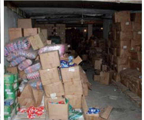
The counterfeited products

October 7, 2010 - One of the Biggest Raids in Beirut's history took place, where more than half a million of counterfeited products were confiscated. The Cyber Crime and Intellectual Property Protection Bureau in the Judiciary Police raided in Borj El Barajne three warehouses and a large distribution store where it confiscated tons of different kinds of imitated goods holding renowned trademarks, mainly: Cosmetics, shampoos, toothpastes, children toothbrushes, detergents, in addition to machines used in the imitation process, in bottling alcoholic beverages and in sealing detergents. Three persons were arrested, and the warehouses and the store were sealed.