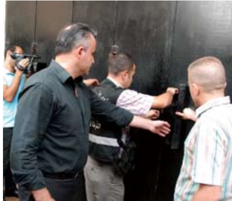
The Cyber Crime and Intellectual Property Protection Bureau raiding a warehouse